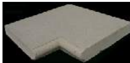
Inside Corner (IC)